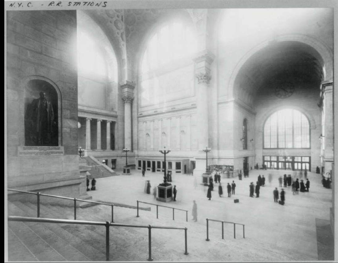
Fig. 7a, b: The Waiting Room and exterior of Pennsylvania Station between 31st and 34th Streets and 7th and 8th Avenues; built 1910, McKim, Mead & White, architects. Image ca. 1911; Courtesy, Library of Congress Prints & Photographs Division, Washington, D.C. Waiting Room: [LC-DIG-ds-04712 (digital file from original); LC-USZ62-68672 [b/w film copy neg.] Exterior: LC-DIG-det-4a23398.