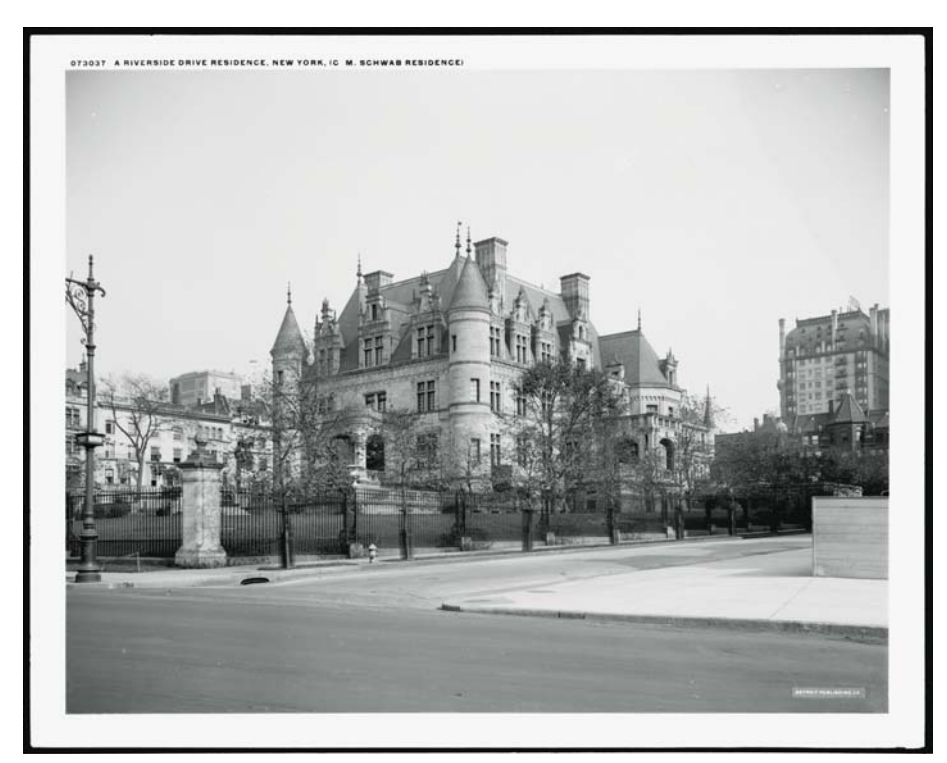
Fig. 6: Charles M. Schwab House, Riverside Drive between West 73rd and West 74th Streets; built 1902–1906, Maurice Hébert, architect. c. 1910–20; This extravagant, seventy-five room mansion was one of the grandest residences ever built in Manhattan. Schwab went bankrupt in the Wall Street Crash of 1929 and bequeathed the house to New York City as an official residence for the city's mayors in 1939. However, reform-minded Mayor Fiorello La Guardia refused to live there and it was eventually demolished in 1948 and replaced with an apartment building; Image ca. 1910–1920. Courtesy, Library of Congress Prints & Photographs Division, Washington, D.C. (LC-DIG-det-4a24599).

Landmarks Law actually has its origins in the mid-nineteenth century when a fascination with historic sites generated public interest in saving important landmarks grew and led to the formation of large numbers of patriotic societies—among them, the Mount Vernon Ladies Association of the Union, the first national preservation organization and the oldest women's patriotic society in the United States.