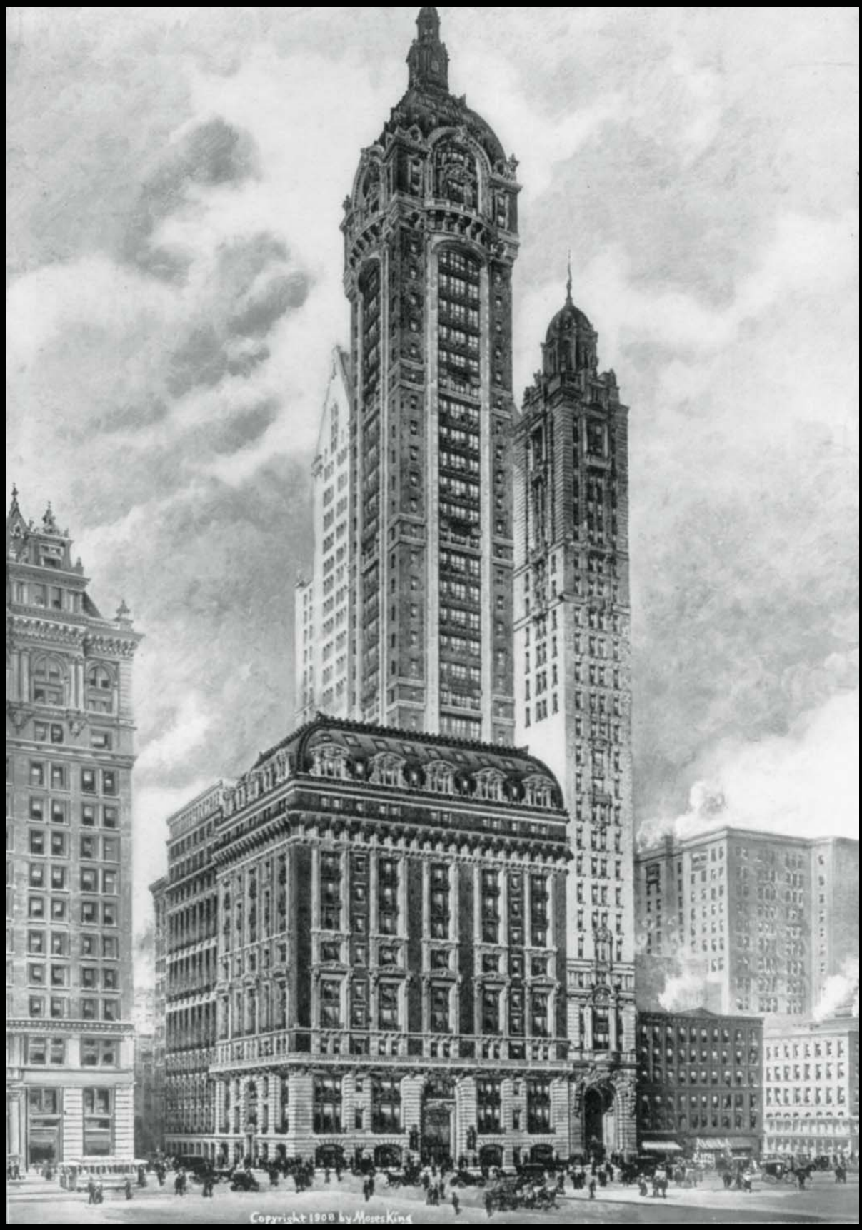
Fig. 8: Singer Building, Liberty Street and Broadway; built 1908–1909, Ernest Flagg, architect. Even since the passage of the Landmarks Law, New York has lost some incredible architectural treasures. The headquarters of the Singer Manufacturing Company, the Singer Building was the tallest building in the world until it was demolished in 1967 and remains the tallest building ever to be demolished. The AIA Guide to New York City called this the "city's greatest loss since Penn Station."; Courtesy, Library of Congress Prints & Photographs Division, Washington, D.C. (LC-USZ62-67472).

8 www.antiquesandfineart.com 15th Anniversary