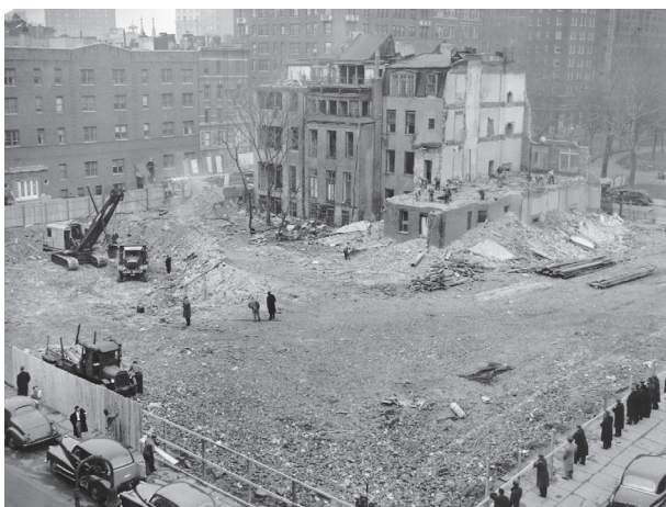
Demolition of Washington Square South between MacDougal Alley and Sullivan Street, 1950; Courtesy of the Greenwich Village Society for Historic Preservation, New York Bound Collection

Bearing witness to the long-established commitment of Greenwich Village preservation efforts, the Greenwich Village Society for Historic Preservation (GVSHP) has worked since 1980 to safeguard the architectural heritage and cultural history of Greenwich Village, the East Village, and NoHo through research, education, and advocacy. GVSHP holds in its archival collection a wide range of materials that reflect the role of the Village as an icon in the local and national preservation movements. GVSHP's image