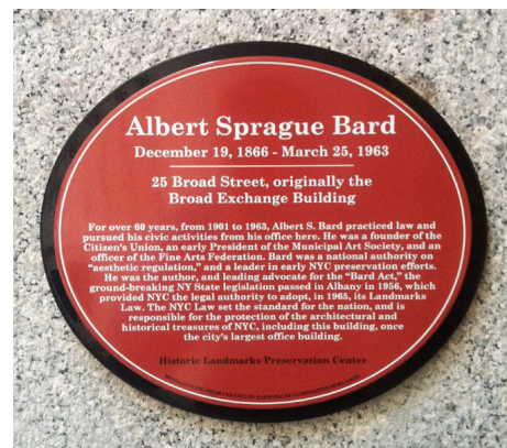
Bard Medallion