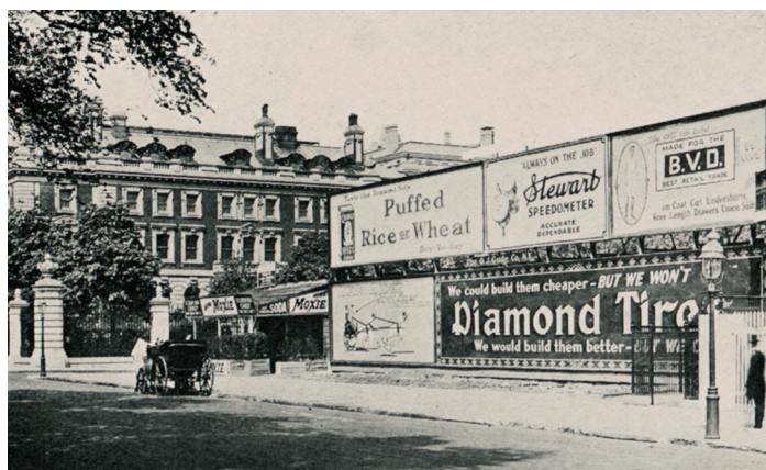
Billboards at Fifth Avenue, 89 th & 90 th Streets; from the Report of the Mayor's Billboard Advertising Commission of the City of New York, 1913