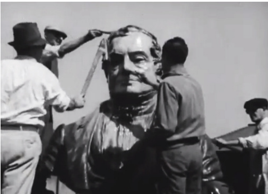
Still from a Karl Gruppe film reel documenting the removal of patina from the Washington Irving Memorial in Prospect Park

The New York City Department of Parks & Recreation has created a digital archive of annual reports and meeting minutes that date back to the mid-19 th century, all of which is now available on the agency's website. The online collection includes annual reports from 1870 through 1930, reports on Central Park dating back to the time of its construction in the 1850s, minutes of parks commissioners' meetings from 1859 to 1930, and press releases from 1934 to 1970. The annual reports reveal many details of land acquisition, capital investment, park usage, and maintenance activities during these years. Many reports also contain historic photos and historical summaries of individual parks. Department activities outside park boundaries are also documented, such as the planting of street trees. Covering both large parks like Central Park and Prospect Park, and smaller neighborhood parks and playgrounds, the information in this collection is useful to anyone seeking to document the history of parks in the City. To view the collection, visit www.nycgovparks.org/news/reports/archive . ■