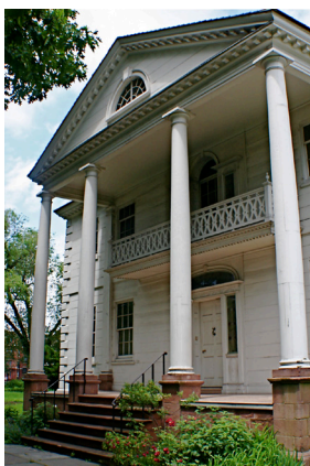
Morris-Jumel Mansion Museum

The response to the Archival Assistance Fund project was heartening: a number of well-known organizations with significant preservation-related histories and important collections applied for grants, demonstrating that there is definitely a need for this kind of funding and that the preservation community recognizes that the Archive Project is there to help. After evaluating the various applications carefully, NYPAP provided funding to five institutions for a total disbursement of $10,000. Three of the recipients are historic house museums—Morris-Jumel Mansion Museum in Washington Heights, Bartow-Pell Mansion Museum in the Bronx, and Merchant's House Museum in Greenwich Village. The remaining two grantees are neighborhood preservation and education organizations—FRIENDS of the Upper East Side Historic Districts and the Greenwich Village Society for Historic Preservation. Each organization cited special needs for archival assistance, ranging from climate control equipment and basic preservation material to digitization projects and the re-housing of collections. (For a list of the specific projects being funded, please see sidebar on facing page.)