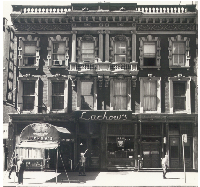
Luchow's, the famous 14th Street German eatery, was demolished in 1995 after a protracted preservation battle.